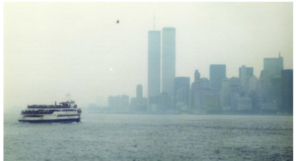
View of a Hazy New York harbour in 1980 – Scene of utter devastation 20 Years ago this September