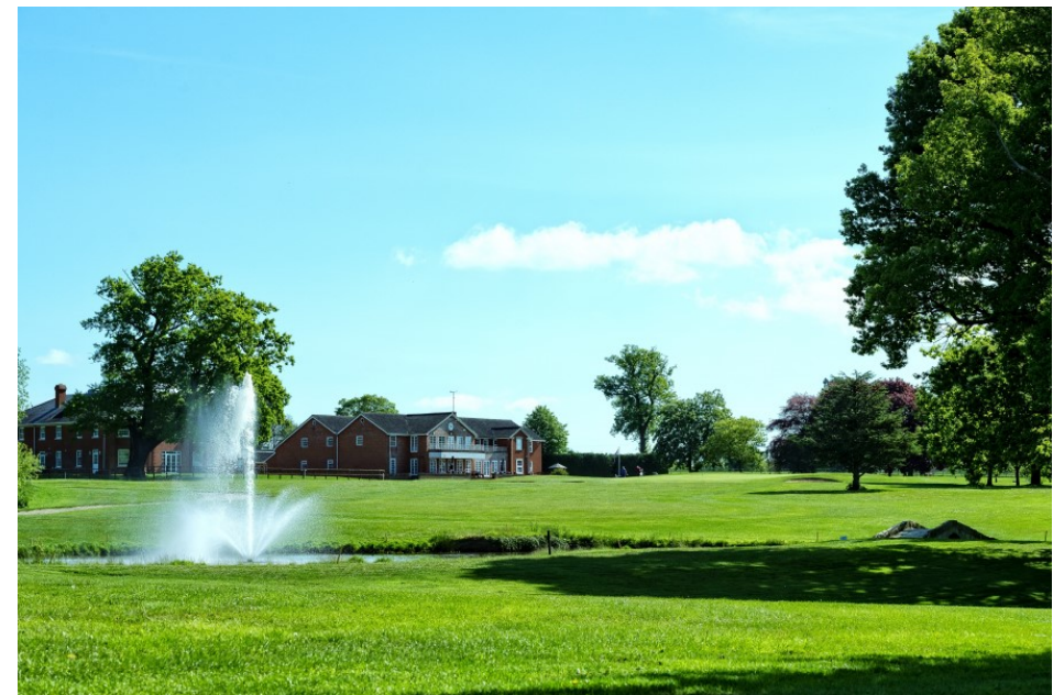
View of Gosfield Lake Golf Club House (see also pages 20 and 21)