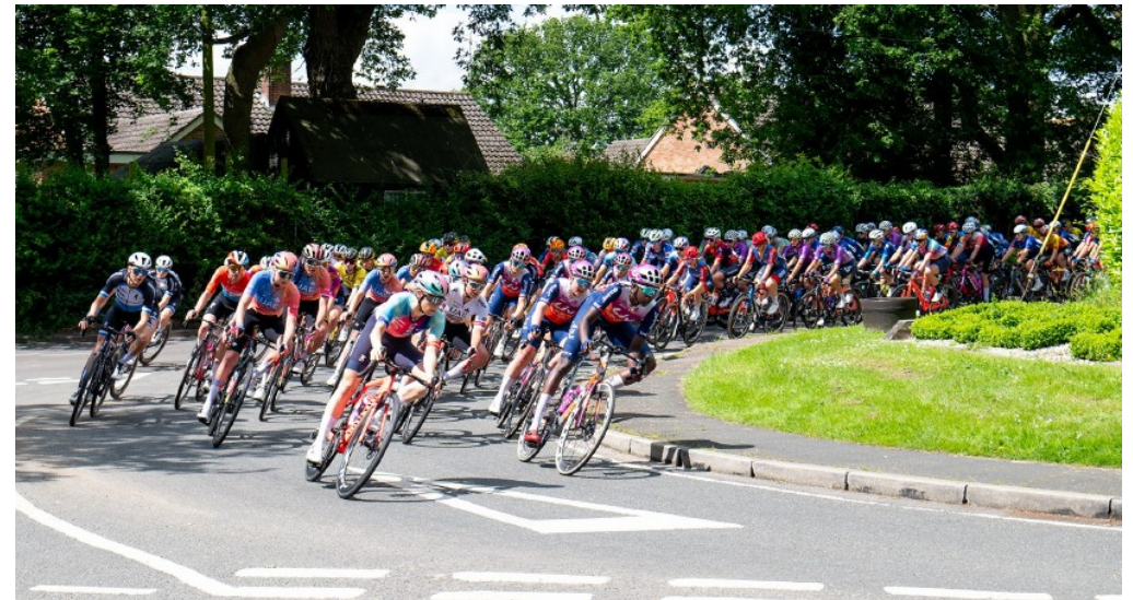
The ladies peleton streams past Gosfield Corner in the Ford RideLondon Classique race in May