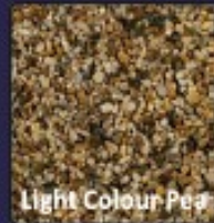
Light Colour Pea