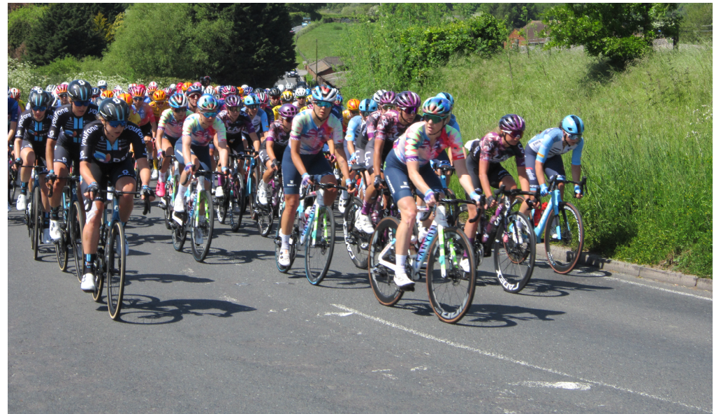
'Ford Ride London-Essex 2023' - Women's Tour Race zips past near to Gosfield in May