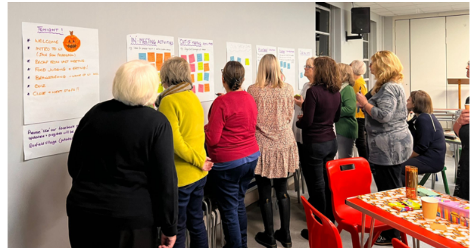
Ladies of the 'Gosfield Girls Women's Institute' (GGWI) brainstorming ideas – see article and photos within