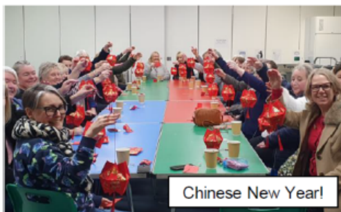
Chinese New Year!