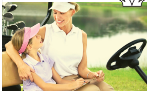
We are an accredited Safe Golf Course so you can rest assured of the welfare of your children.

For further information regarding our new member packages, please call the office on 01787 474747.