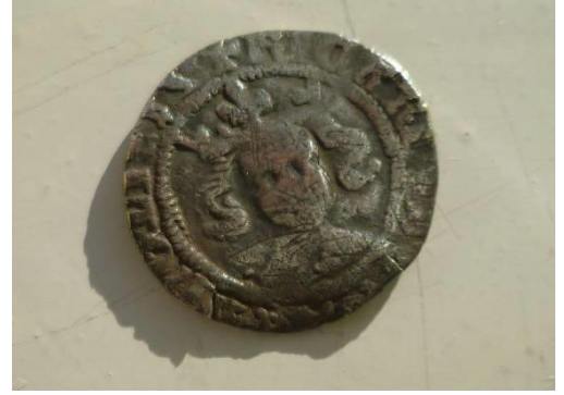
Richard II silver penny minted in York 1377, 3/4" diameter #

the east of The Vale running behind Potash Road (over which the King's knights rode). So too is