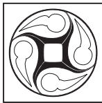
Great Horwood Parish Council