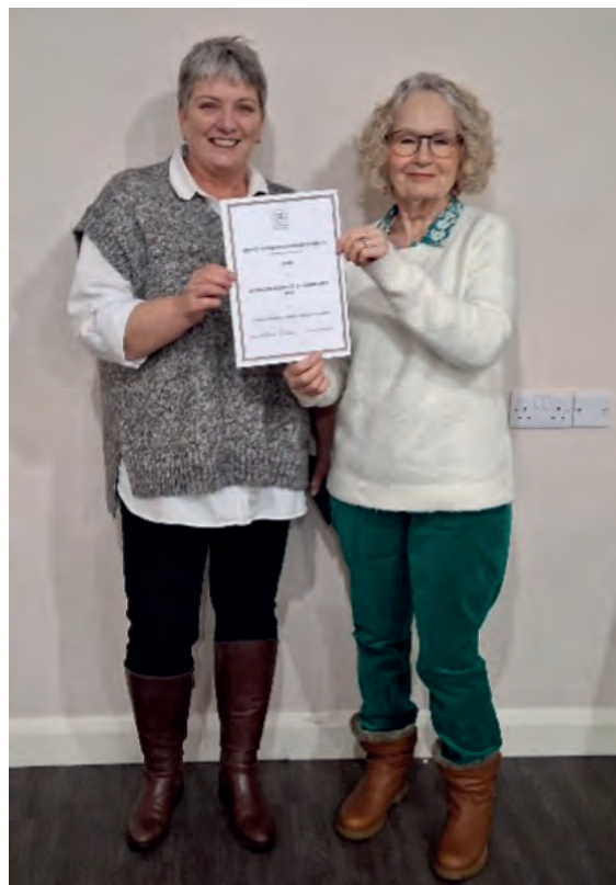
Winslow and District Community Bus