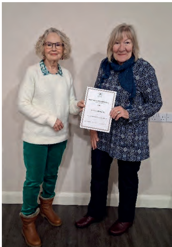
Great Horwood WI