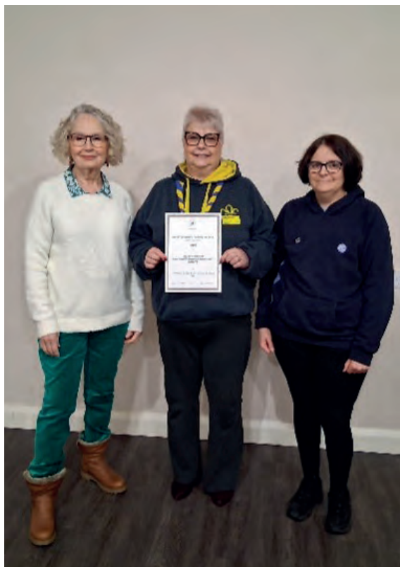
Great Horwood Rainbows/Brownies/Scouts