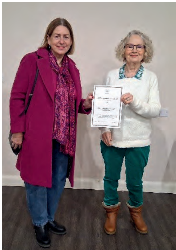
Great Horwood Art and Craft Club