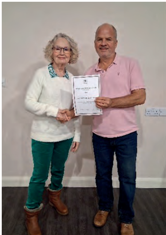
Great Horwood Football Club

At the Parish Council meeting held on 15th December 2025, the Worthy Causes Grant awards and certificates were made to the following organisations: -