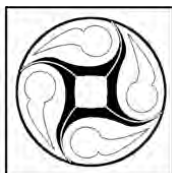
Great Horwood Parish Council

The Neighbourhood Plan Steering Group will be holding a consultation on various possible options for the emerging Neighbourhood Plan in the Village Hall on Saturday 21 March. More details will be published on the Parish Council website and Notice Board nearer the time. The Neighbourhood Plan will affect you all, so please do come along and make your views known.