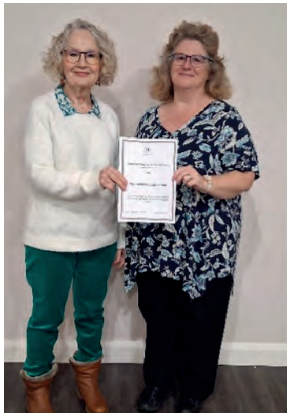
Great Horwood CofE School