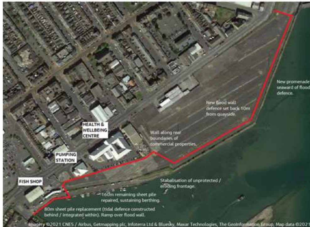
Key areas of the frontage through the proposed scheme area