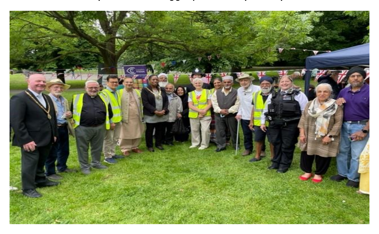
Inter Faith Platinum Jubilee Picnic in Croydon demonstrated the value of working