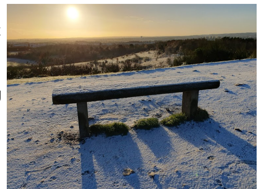
What a place!

And finally I cannot finish without reminding people that the Friends Calendar 2023 is still available. So if Santa didn't bring you a calendar then why not pop down to the Park. Copies are available from the Countryside Centre café (cash only) and the Earth and Fire Bakery down at the Rising Sun Farm. (cash or card). A massive thank you to the Bakery who have sponsored the calendar once again.