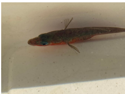
3 Spined Stickleback

Observations were made using an iPhone and the iNaturalist app and shared to CNC 2022: North East England Project. There were 169 observers taking part in the North East England Project, making a total of 4045 observations of 1044 different species. The Friends Group ranked 7 th , making 179 observations of 139 different species! A few of the findings: