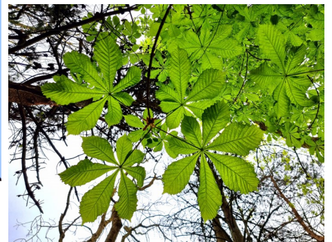
Horse Chestnut (3rd)