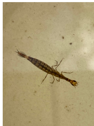
Small Flat Diving beetle larvae