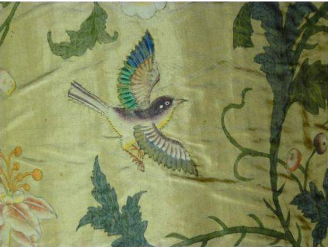
Detail: Curtains in the Yellow Taffeta Bedroom.