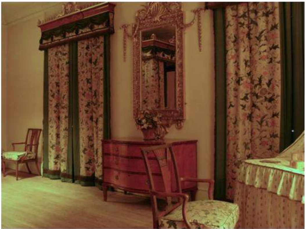
Yellow Taffeta Bedroom.