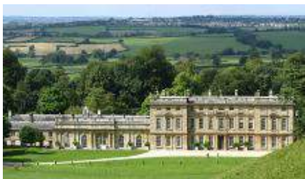
Dyrham Park lower park

Tuesday 12th May 2015 cost £17 Dyrham Park, near Bath. The house is set in ancient parkland where 185 fallow deer roam freely amongst magnificent trees, breath-taking views abound. (So we will hope for a fine day).