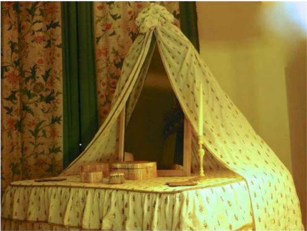
Dressing Table, Yellow Taffeta Bedroom.