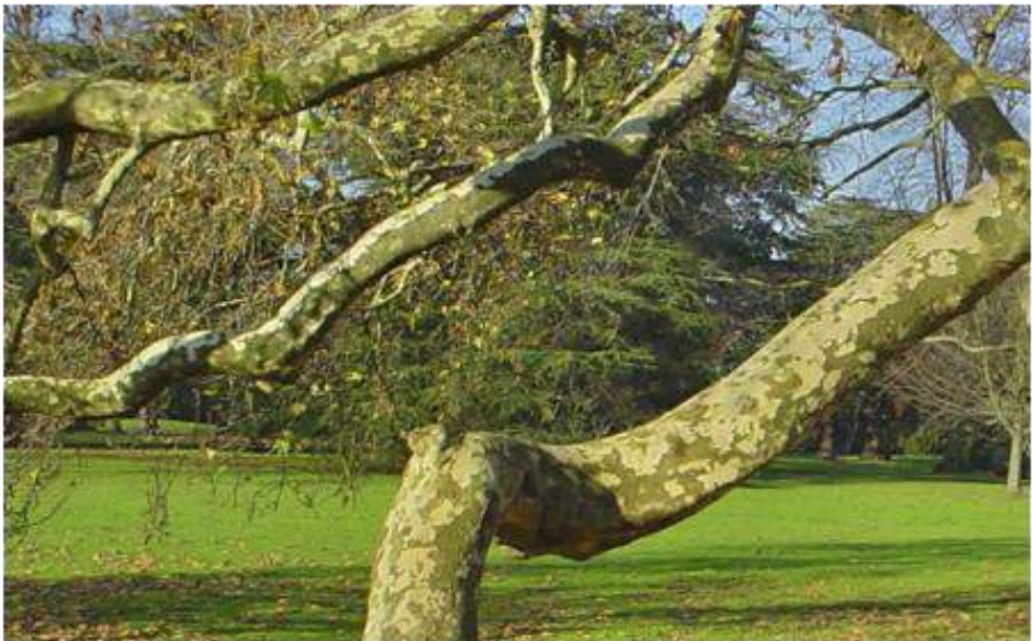
The Old Plane Tree.