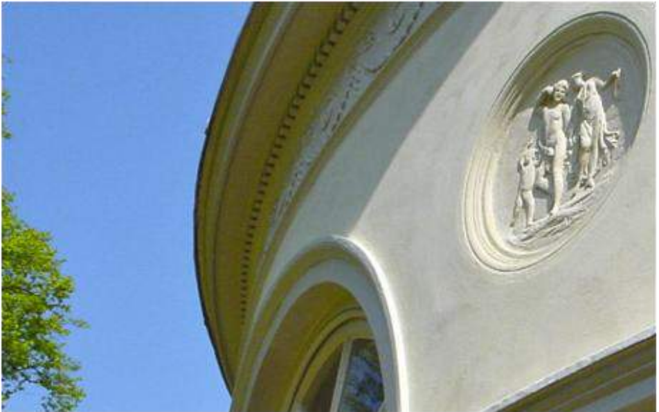
The Summer House