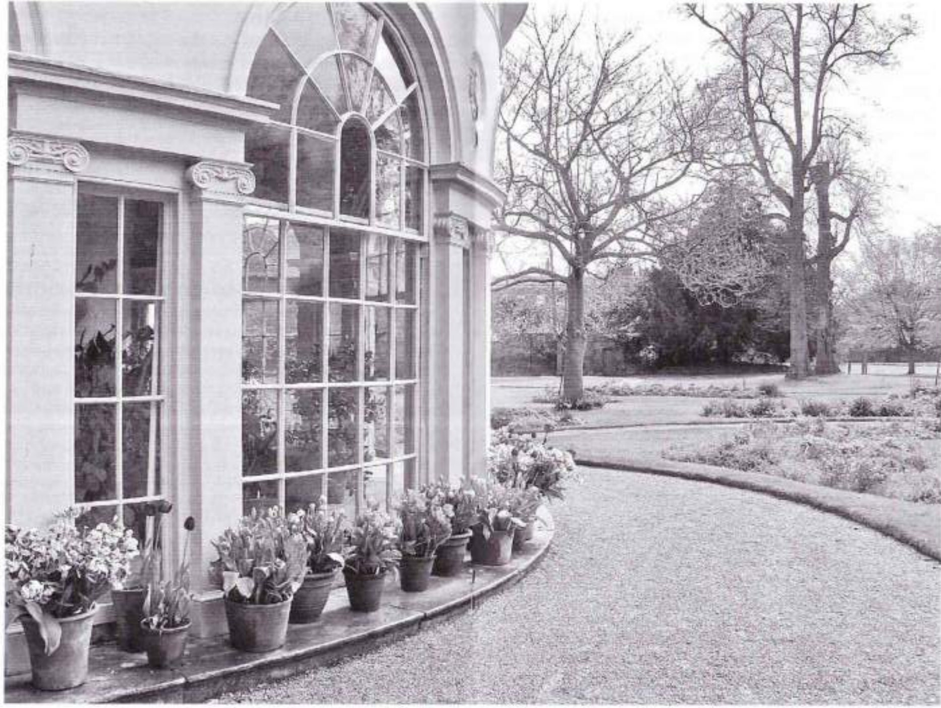
Garden House—exterior view, Osterley Park, London