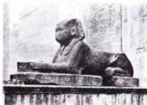
Above left: sphinx detail from Robert Adam design for Garden House at Osterley [from design in garden room]. Above right: sphinx from Diocletian's Palace in Split, now Croatia, which Adam studied on his travels in Europe.

These have now gone but the stucco decorations showing festive figures still feature on the exterior. The classical sphinx was seen as the guardian of Arcadia, the ideal home of the gods Jupiter and Pan with nymphs, satyrs, shepherds and shepherdesses, evoking the wish that the Childs' garden be protected by the sphinx as was the garden of the gods. Ionic pilasters flank the sash style windows which can be opened (see below) allowing people and plants to move and be moved easily in and out of the Garden House. Guests could sit amongst the flowers in the Garden House and enjoy the beauty of the gardens around them.