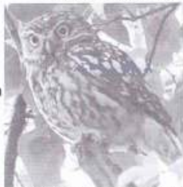
Little owl has been seen at Osterley This photo (not from Osterley): Trish Steel (Creative Commons Attribution-ShareAlike 2.0 license)