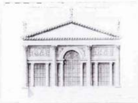
Greenhouse design by Adam for Kedleston

The Great Greenhouse, also of wood, was designed by Adam and constructed in 1764. After the smaller Garden House was built, the larger building became known the Great Greenhouse. It was 90ft (27 metres) long and 20ft