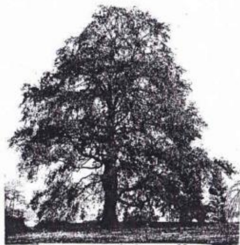
Lucombe Oak, at Kew

Unfortunately, even specimen trees have a finite life span. The Hungarian Oak in the East Meadow, on the left hand side of the prospect looking from the drive, has died. Kevin tells me that it will be stripped of all hazardous branches, and left standing to provide a habitat for various beetles, fungi and other wildlife.