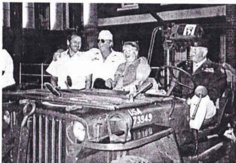
Jeeps at Osterley