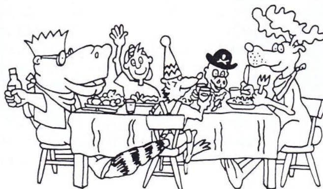
Linda's Animal Family Christmas Party

Full grown cattle egrets stand around 20 inches tall, and are normally all white. This one is in its breeding plumage, with buff coloured plumes on its head, breast and mantle. You can find more photos of the egret, and other wildlife at: www.uksafari.com