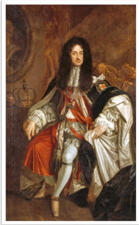
King Charles II