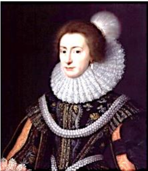
Queen Elizabeth of Bohemia