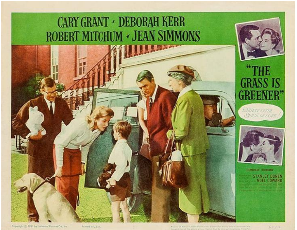
The Grass is Greener (1960), starring Cary Grant, Deborah Kerr, Robert Mitchum and Joan Simmons. The back of Osterley House featured as the main entrance.

Issue 121 Summer 2021 £1 (free to members)