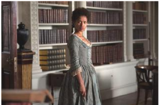
Gugu Mbatha-Raw as Belle in the library at Osterley.

The portrait of Belle was featured in Fake or Fortune? on BBC4 earlier this year. Chief Justice Sir James Mansfield radically influenced the laws on slavery in England exhibiting his feelings by bringing up his brother's mixed race daughter as his own.