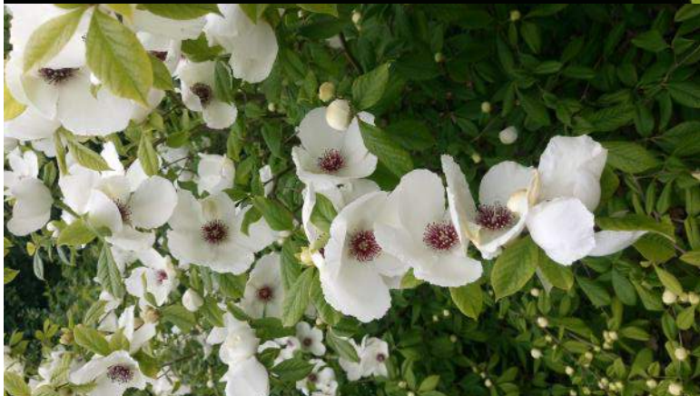
Stewartia Malecodendron the 'Silky Camellia'. at Osterley