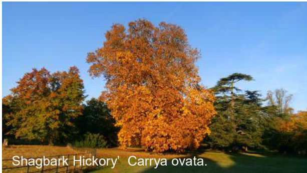
Shagbark Hickory' Carya ovata .

From North America we also have a rare shag-bark hickory tree and the marvellous magnolia grandiflora with its huge blossoms gracing the back of the house.