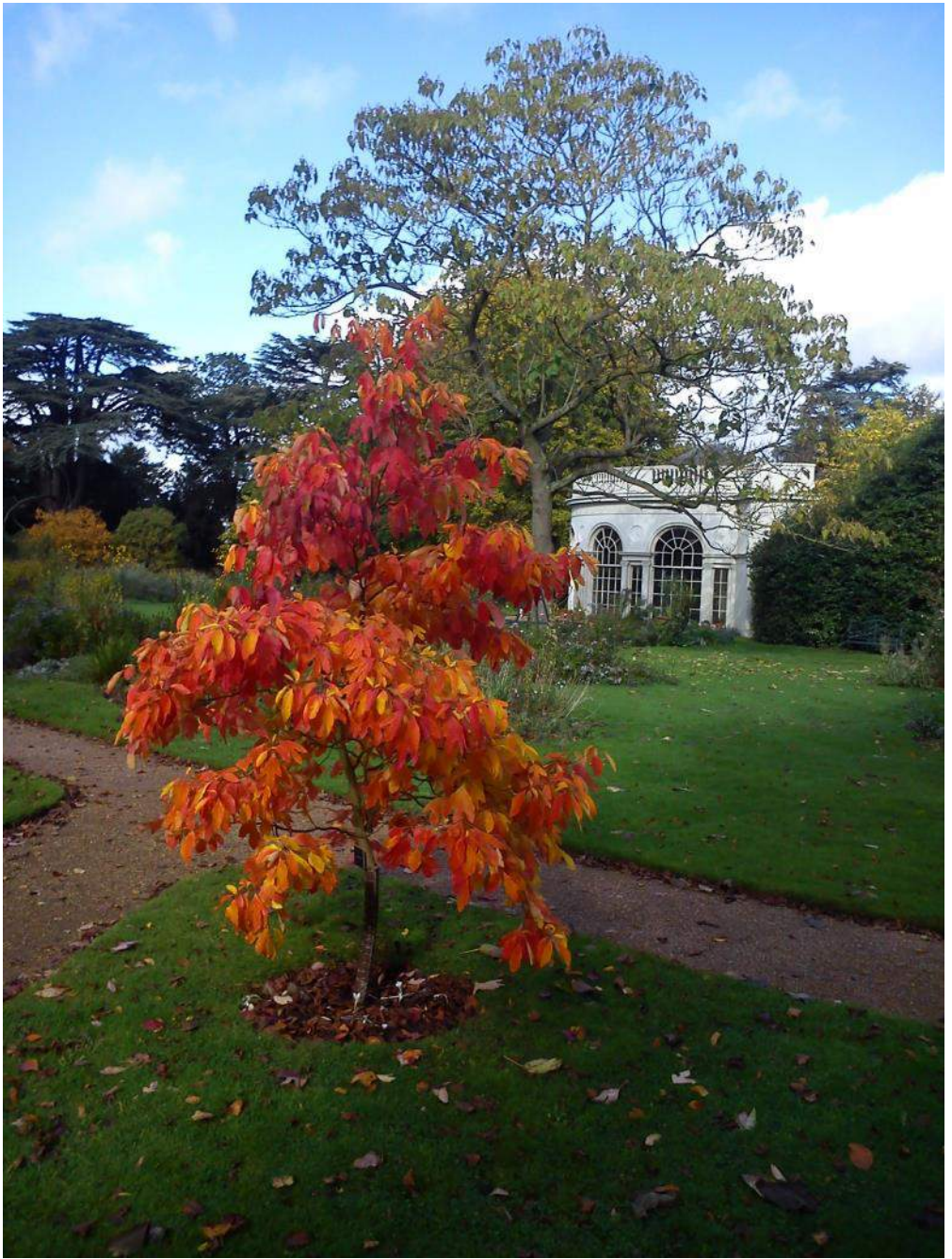
Sassafras Albidum with the newly renovated garden house behind