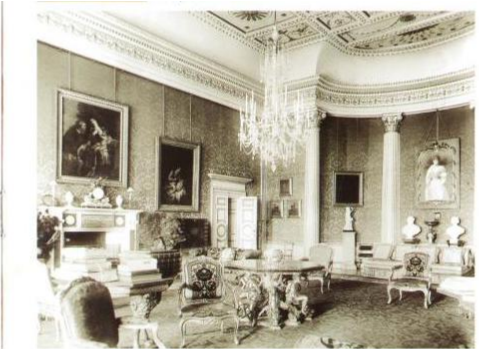
Stowe Temple Room