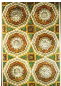
West Wycombe Ceiling