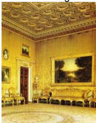
Osterley Ceiling and carpet

Our Drawing Room ceiling is a close copy of the original deeply coffered ceiling in the southern niche of the Temple to Bel. It differs as the centre roundel has been extended to an oval to fit Robert Adam's rectangular Drawing Room. Adam's original plan shows one fewer line of octagonal coffers but these coffers proved to be too large and heavy looking for the Osterley ceiling so Adam made the coffers smaller and added another row to use the space. See centre page picture of the splendid ceiling. He also added the red frieze and completed the room by designing a carpet to reflect the ceiling. The Adam drawing for the carpet can still be seen in the house.