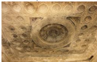
Original Photo of Palmyra southern niche ceiling