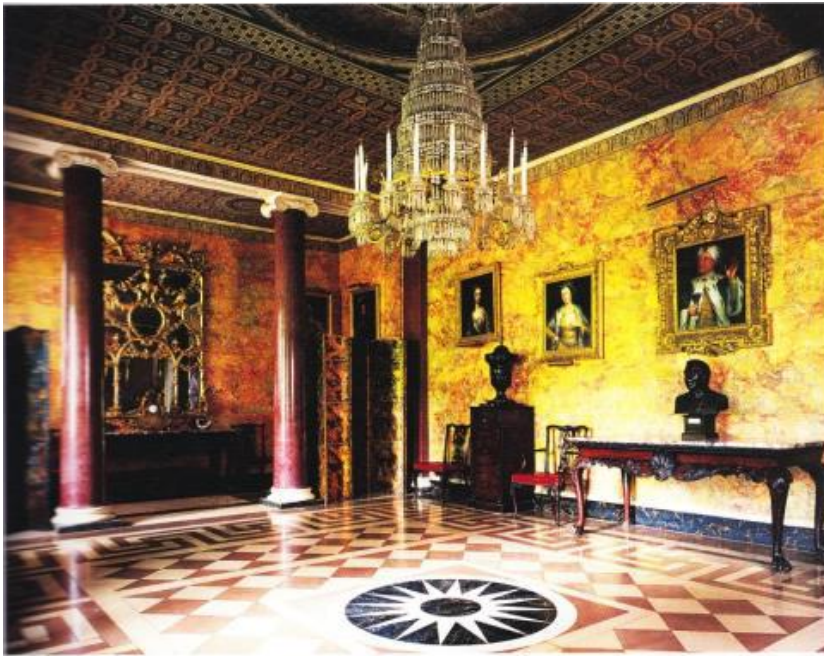
West Wycombe dining room