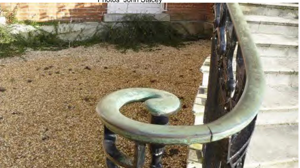
Friends of Osterley Park Newsletter Issue 104 Spring 2017