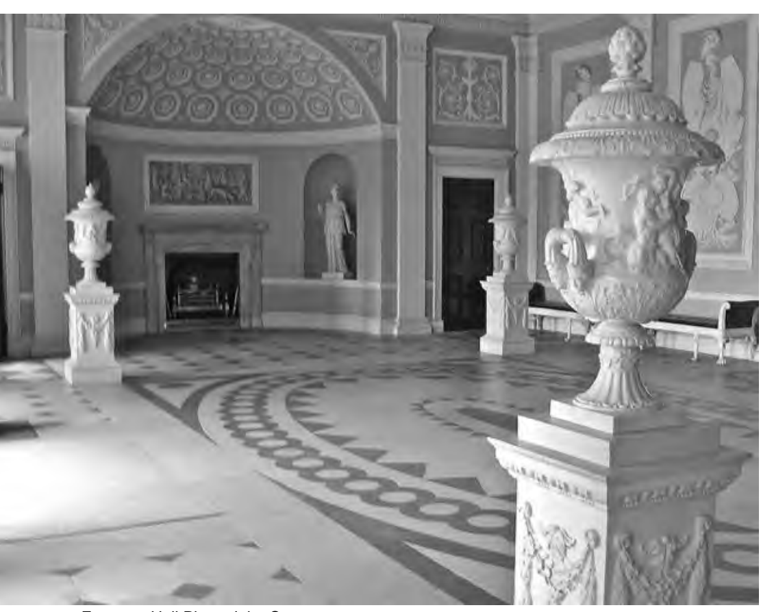
Entrance Hall