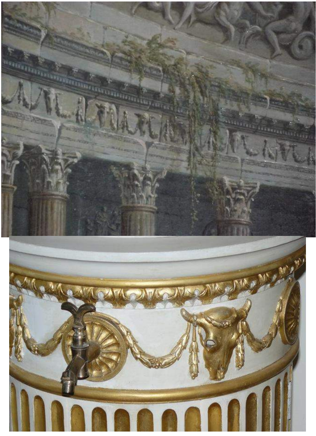
Friends of Osterley Park Newsletter Issue 101 Summer 2016