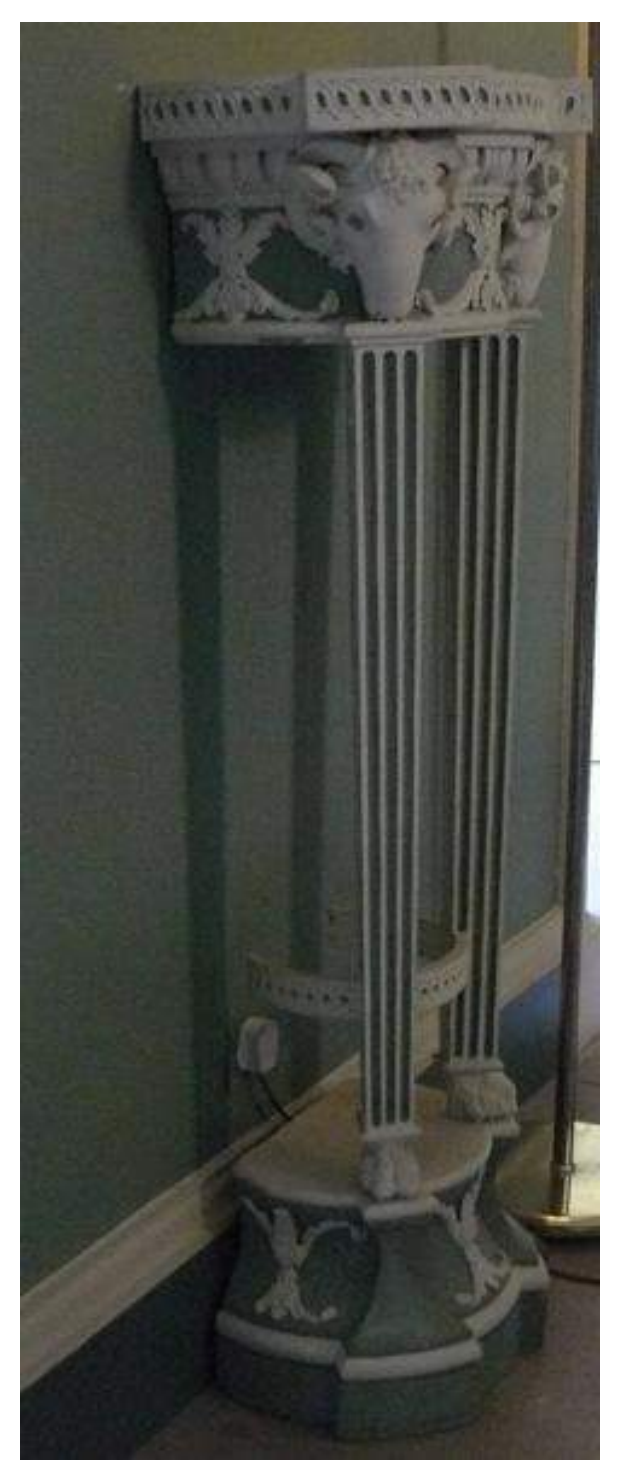
Friends of Osterley Park Newsletter Issue 101 Summer 2016