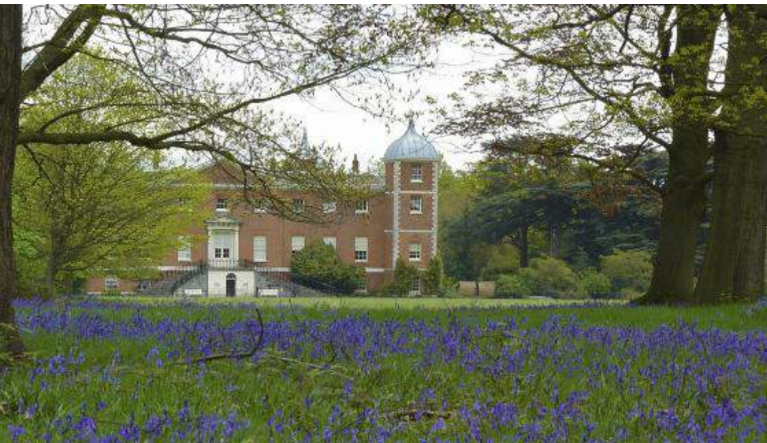
Osterley House bluebells