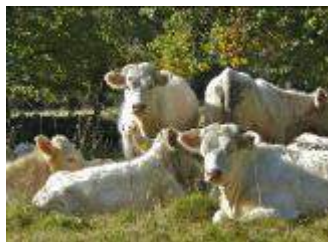
Osterley cattle