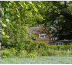
Osterley Farm house