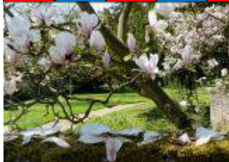
Blossom