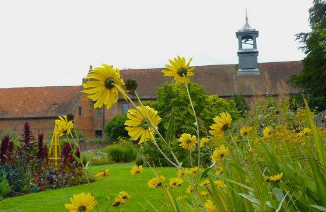
Osterley Stables and marigolds