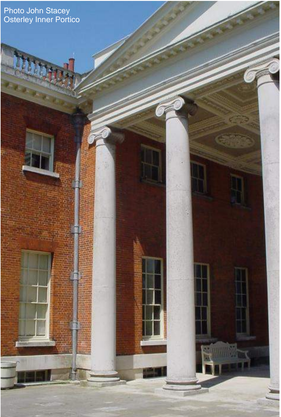
Osterley Inner Portico