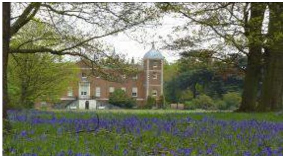
Osterley House bluebells

The restoration of the almost circular laurel walk would allow visitors to view the house from the park seeing it as a three dimensional building rather than the flat single sided look we often see today. Take a walk along the path at the back of the great meadow also known as the bluebell walk to see the house as Adam wished it to be viewed.