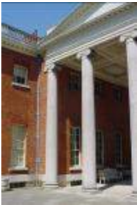
Osterley Inner Portico