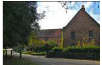
Osterley Stables