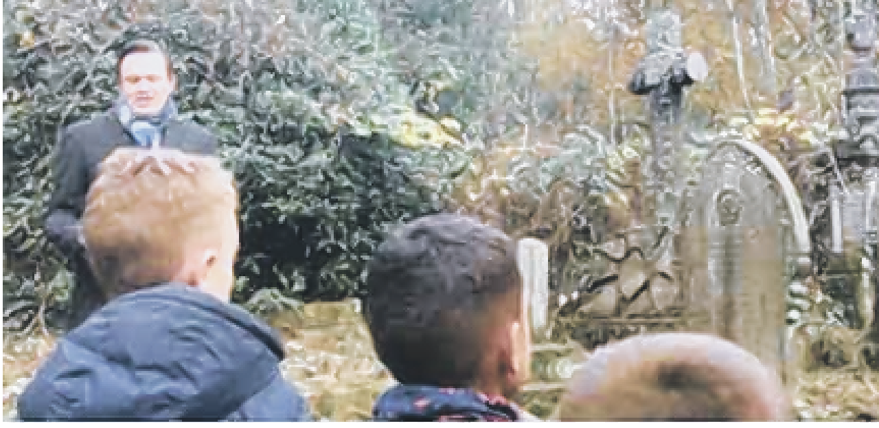
The Friends of Loxley Cemetery joined together with Loxley Primary pupils at the historic cemetery for a special event remembering local war heroes

The event – which saw FoLC and the school join together at the cemetery to pay respects – stemmed from a chance meeting last year when a member of the