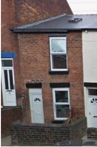
24 Fowler (Findon) Street