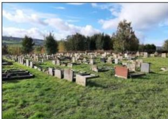
Photograph taken in February 2021 before clearance work. Photograph taken in November 2021 after the clearance.

Notice the red coloured headstone in both pictures – it is the same one!!