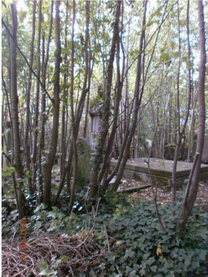
Tackled the sycamore