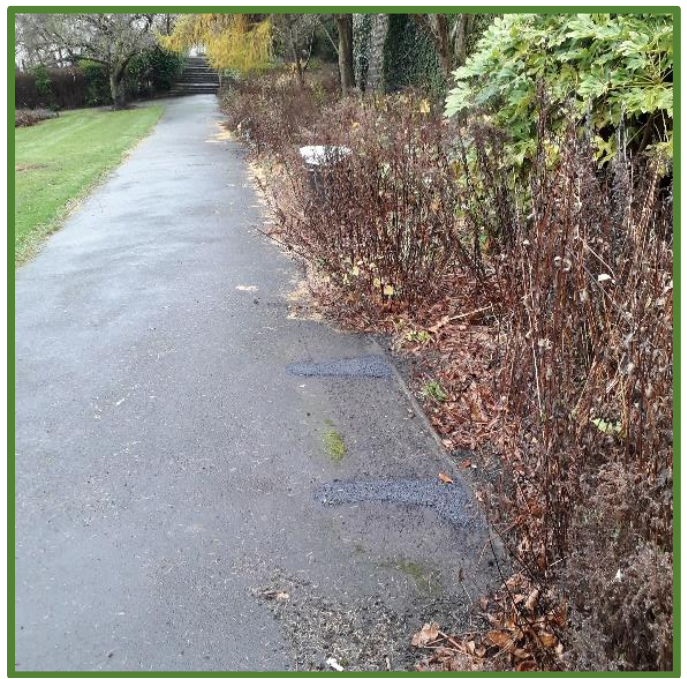
Space for a new bench. Any takers?

Three old benches were removed so there is space for a new bench. Please get in touch if you would like to sponsor a memorial or family bench.