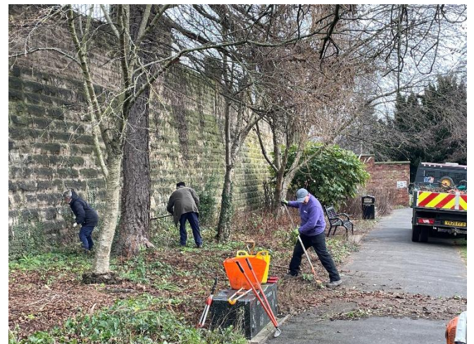
Working with the Park Ranger Team

The Council's Park Ranger Team are in the Valley Gardens most days of the week and do a great job.