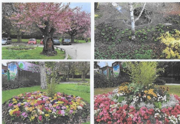
Spring blossom, ferns planted at cul-de-sac end and flower bed spring and summer.

Our small team of volunteers is active throughout the year. Our regular gardening session is every Saturday 2 - 4pm, and litter picking 1 st Sunday of each month at 10.30am. New volunteers always welcome. We do arrange sessions on other days and will notify them on Facebook and Citizen Coin ( citizencoin.co.uk ). You can earn citizen coins by volunteering with us, and use the coins for discounts in participating local businesses and Aspire @ the Park.