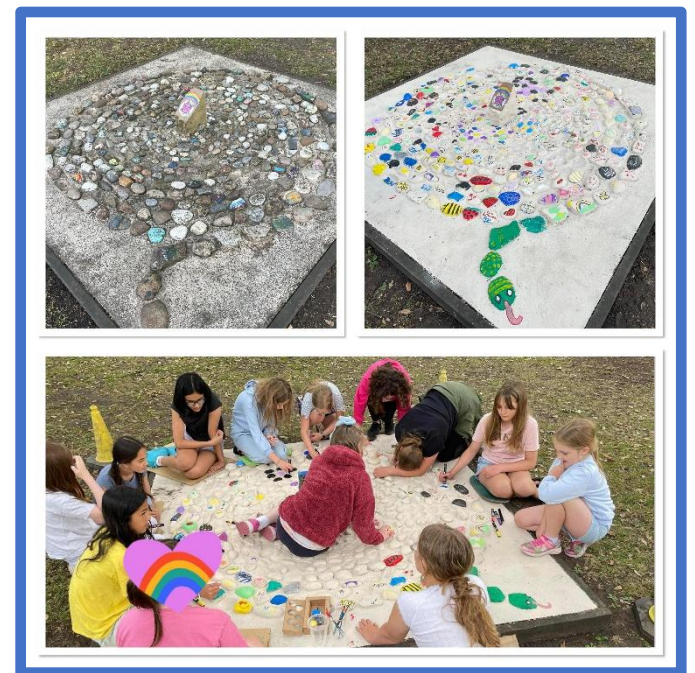
41 st Pontefract Guides busy on 1 st July 2025

The Covid Circle of Hope was installed in 2020 and after 5 years was looking sad. Fortunately, 41 st Pontefract Guides were keen to help restore it and decorate the stones. Before and after: