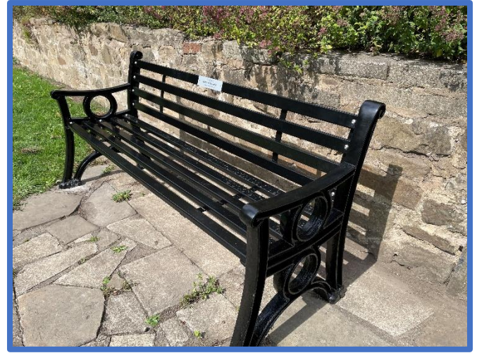
Restored metal bench