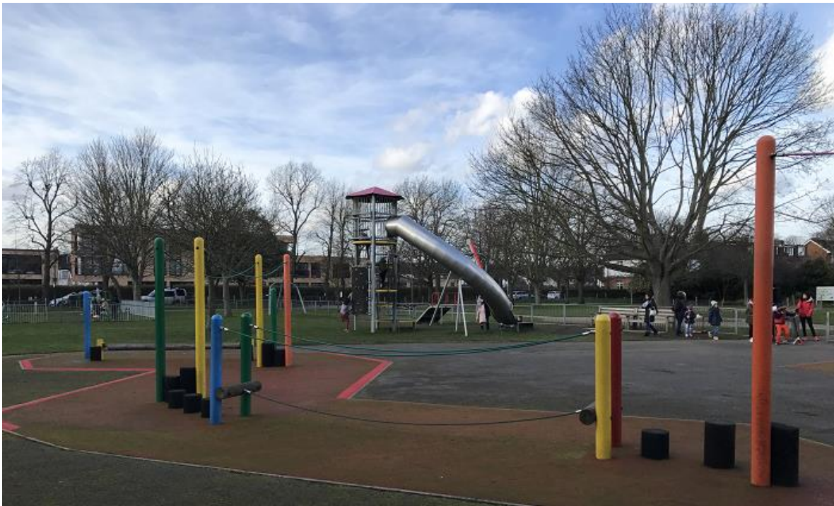
Senior playground, North Sheen Rec

The play areas were refreshed in 2016, with new equipment installed and older but still viable equipment renovated.