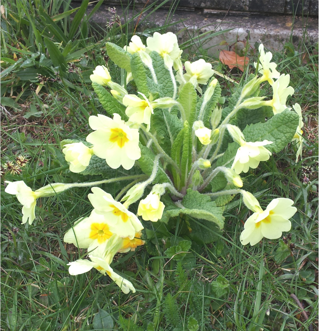
Primroses at All Saints' Churchyard