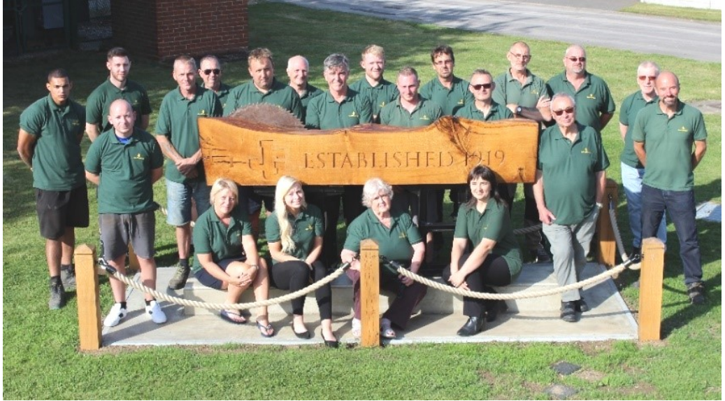
Gards staff with the Oak feature commissioned to celebrate 100 Years

The East Hanningfield site offered adequate customer parking enabling trading well into the future. Now one of the largest independent timber merchants in Essex, Gards serves both trade & the general public. Good customer service has always been key to the business &