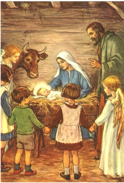
Cicely Mary Barker

I wonder what is going on in your life at the moment. I hope you will feel able to take in a little of the awe and wonder of the season, little children dressing up, carols with lovely words and heart string pulling tunes, happy faces enjoying parties and unwrapping presents, twinkling lights all around in the dreary darkness of November and December, an extra sense of good will. We do need this after all that has gone on in the year & we must not let the election pandemonium destroy it.