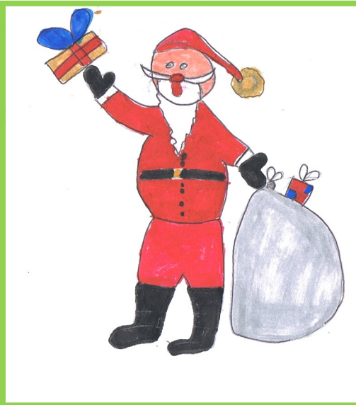
Santa with his sack