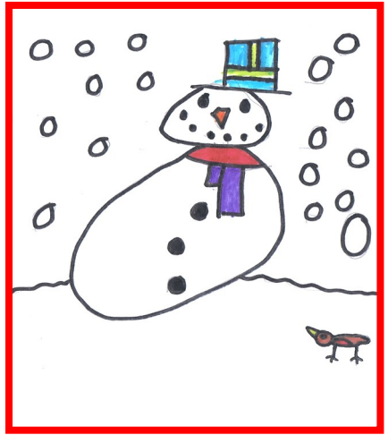
Snowman by GEORGE TURNER

number of people who were unable to attend, and on the day 20 people came along to debate a way forward for future events, mainly those who have already been involved in past events but a few new faces which was very good to see. It would have been encouraging though to have seen more interest from some new blood in terms of younger village input to become involved with keeping these important facilities going in the future. The outcome of the meeting was that the Village Fete should continue, a meeting was set for 8pm on 27 th November to start the planning of next year's Fete on 4 th or 11 th July 2020. If you would like to be involved please come along to one of our meetings!