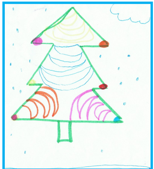
Tree by AVA INGHAM