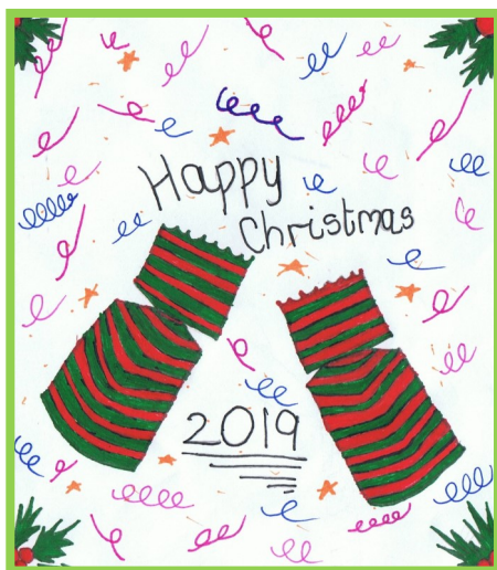
Christmas Cracker by a Class 4 pupil

There has been so much 'stuff,' going on and now we have an election in the Christmas season. So I do hope it will not detract from our opportunity to enjoy this unique time of year. Whatever our thoughts and beliefs, it is an opportunity to think of humanities good will to one another, instead of disagreements and differences. A time to give gifts, think of others, be together and do things we may not do at other times, like singing carols, watching a child's nativity play, eating Christmas food and having parties.