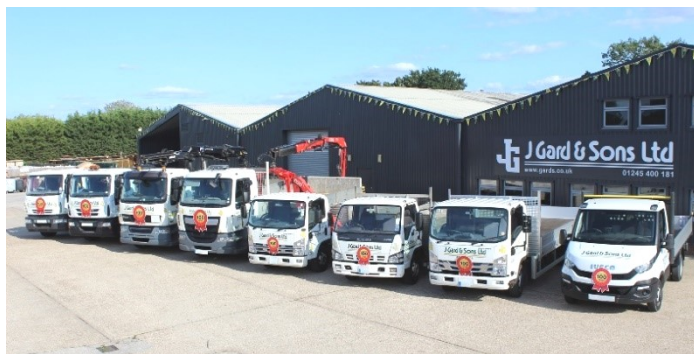
The East Hanningfield premises