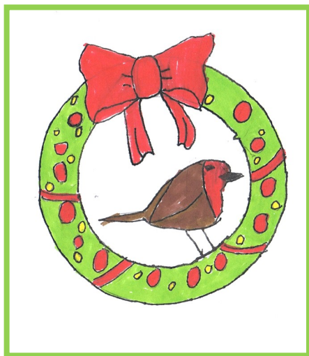
Wreath with Robin by LOUIS GARDEN

Are there any other road safety features that PC could apply for? It could be that the idea has already been put to the Panel and turned down. The list of rejections is too long to itemise here, but a new way of looking at a problem might turn out to be successful, so please don't be shy!