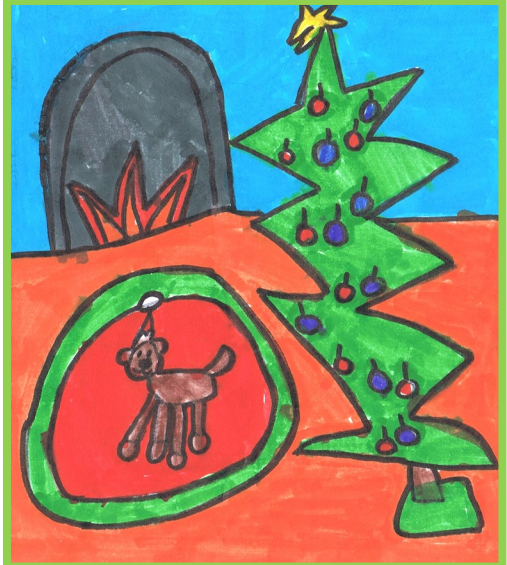
Tree by the Fire by SOFIA HILL