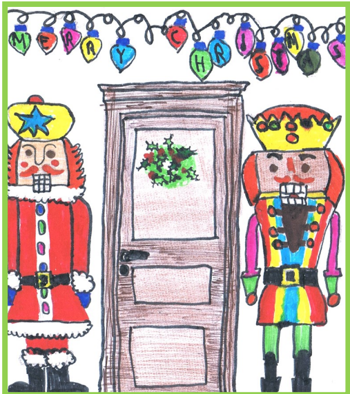
Nutcrackers by OLIVER WOLF KIRK