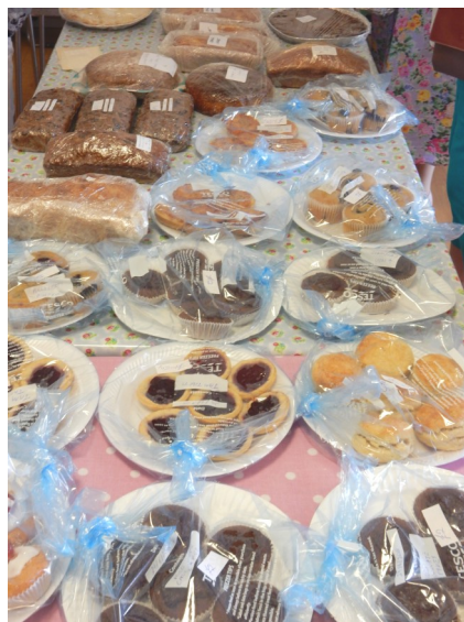
Some of the cakes at last Summer's Fete

We are again organising the Cake Stall at our Summer Village Fete and also doing refreshments at the Autumn Art Exhibition. Home made help for both events would be greatly appreciated.