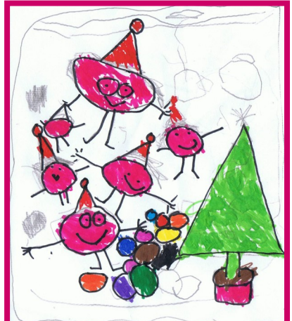
Decorating the Tree

Those proven to be responsible for injury to livestock, horses, horse owners and their property will be held accountable if they choose to ignore this advice.