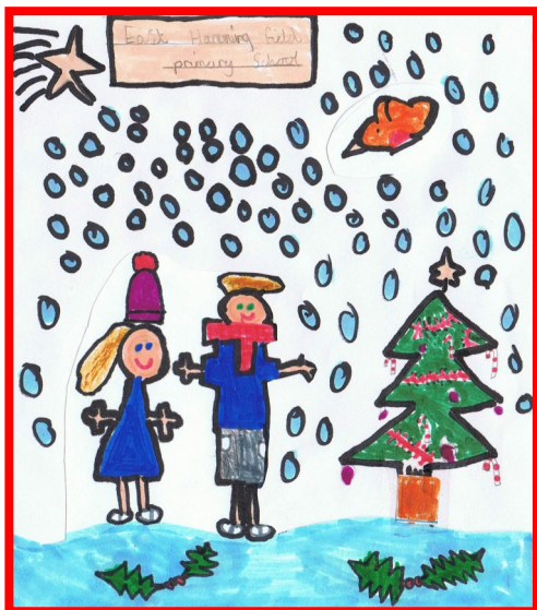
Class 3 Runner-up Niamh Crozier