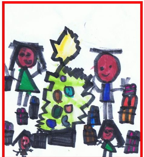
Family around the Tree

This month's PC Meeting takes place earlier than usual on 13th. December, but thereafter Meetings will revert back to the FOURTH THURSDAY of each month. The December Meeting will concentrate on agreeing the Budget for the 2019/20 financial year,