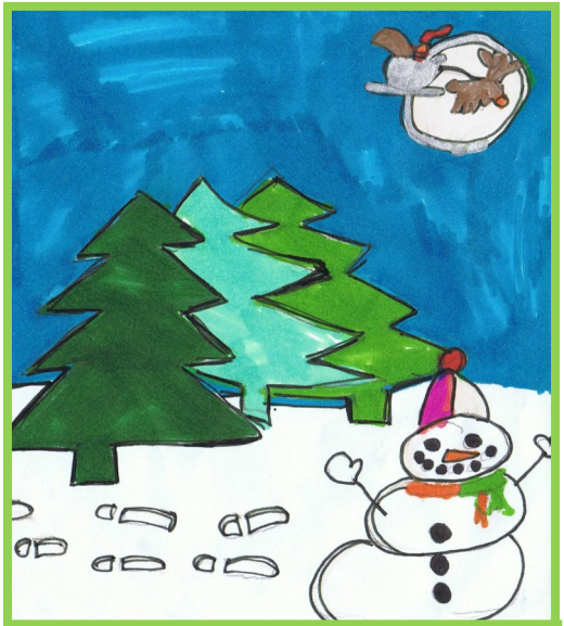
Christmas Eve by Francesca Fitzmaurice