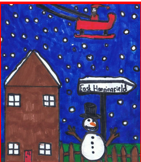
Santa coming to our Village by Layla Wing

1. To pedestrians by causing an obstruction that may result in them having to step off the pavement into the carriageway, thus putting themselves in danger.