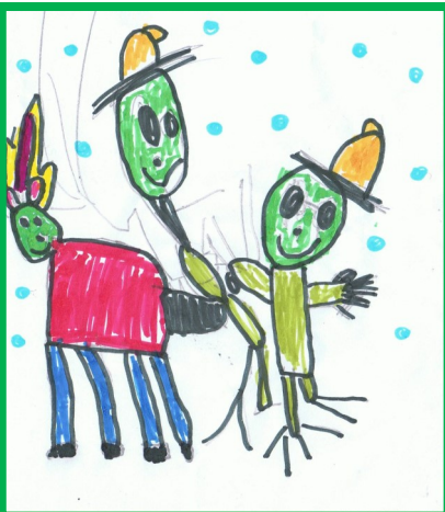
Elves in the Snow by Harry Wiltshire

neighbouring property - do you really know where those rockets land?