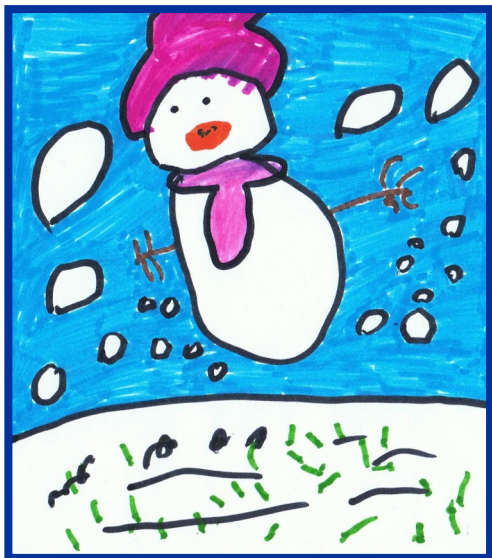
Class 1 Runner-up (Artist's name withheld)