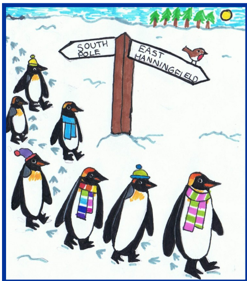
Class 4 Runner-up (Artist's name withheld)