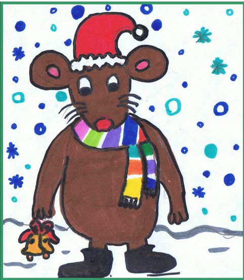
Class 3: ELENA WILLIAMS