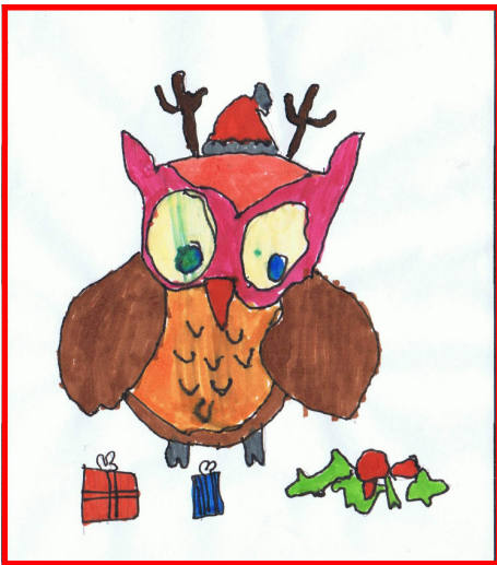
EDWARD W K