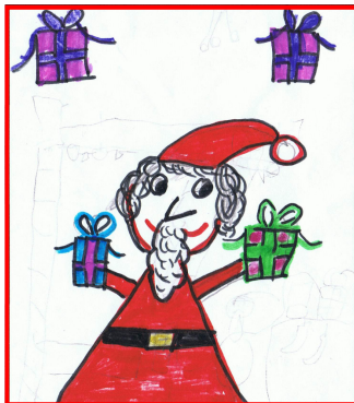
K C STONES