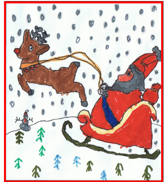
OLIVER WORF KIRK