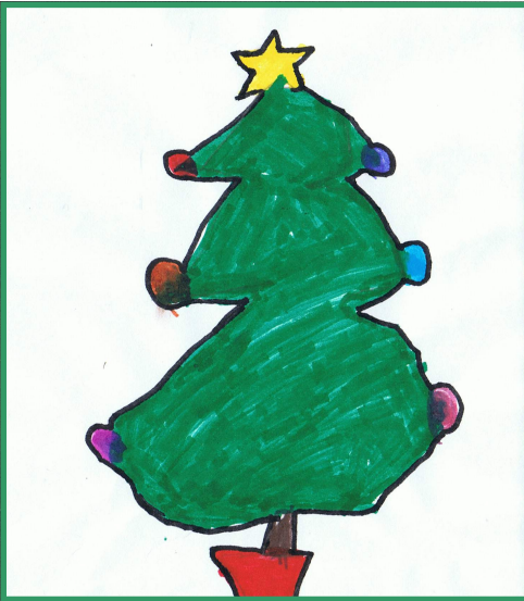
Class 1: SAM FLEMING