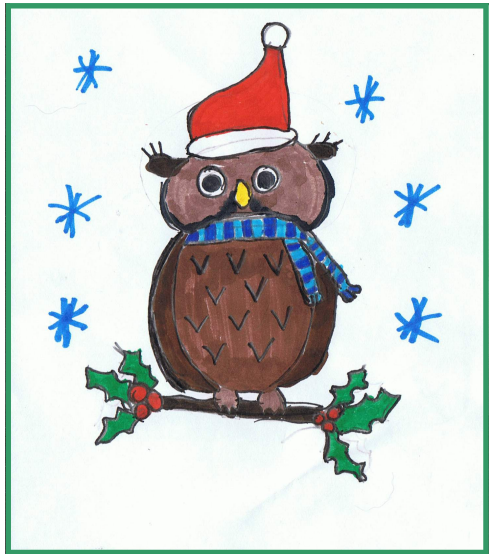
Class 4: EMMA KINGSNORTH