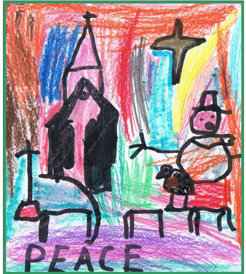
Class 2: BLU DAVIS