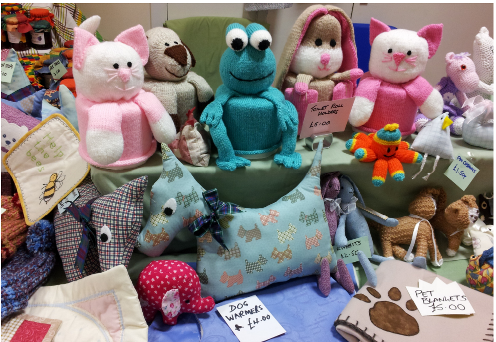
A small sample of the items for sale on the WI stand at the last Art Exhibition & Sale