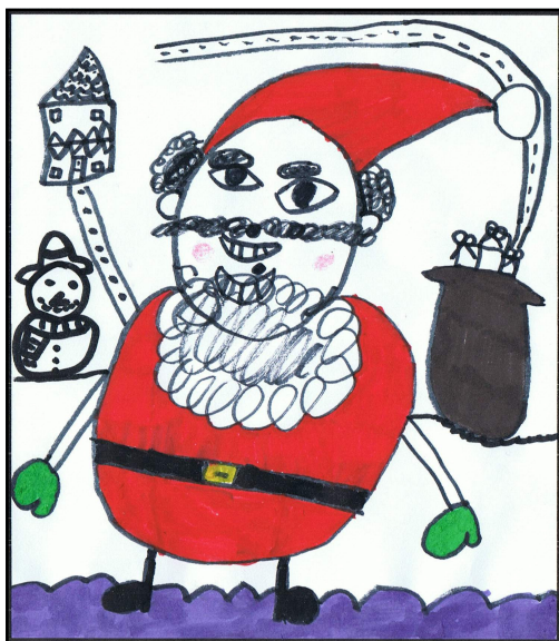
Class 2 CHARLOTTE CLARK