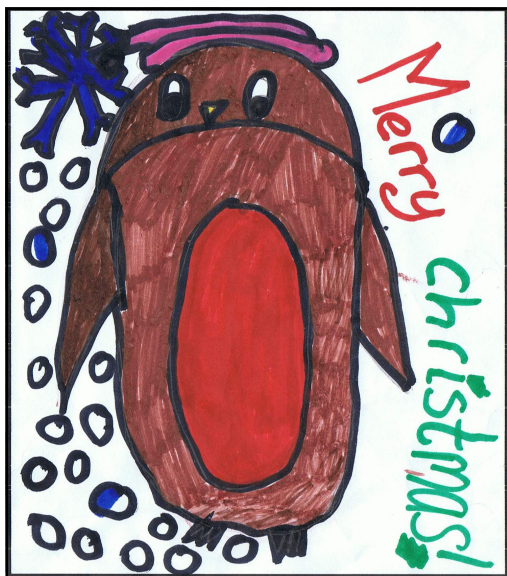
Class 3 ISABELLE CUE