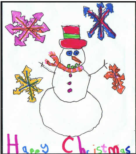
EDWARD WORF KIRK