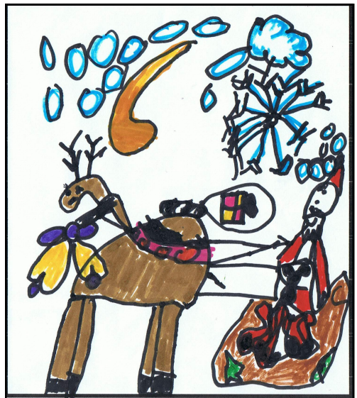
K C STONES