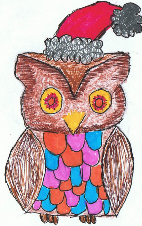
CHARLIE WORF KIRK