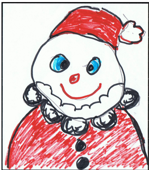
Class 1 STEVI-LEI SLINGO