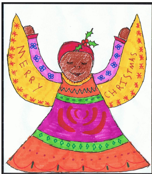
Class 4 OSCAR WORF KIRK