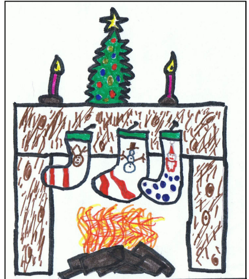
Class 4 Amy Kingsnorth