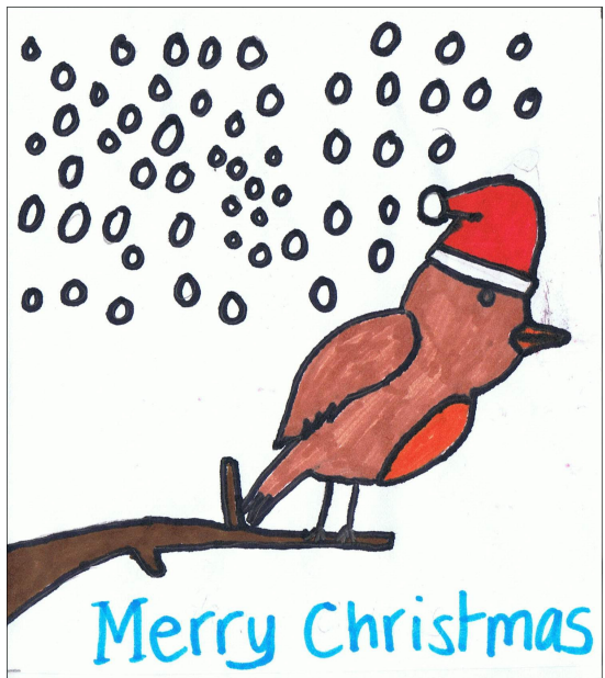
Robin in the Snow