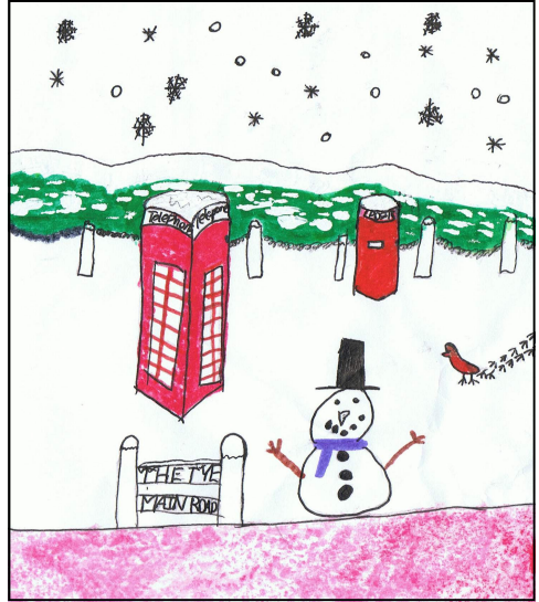
Class 2 Deryn