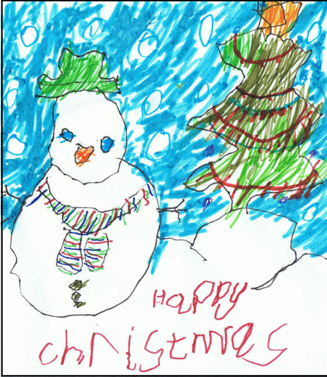
Class 1 Oliver Worf Kirk