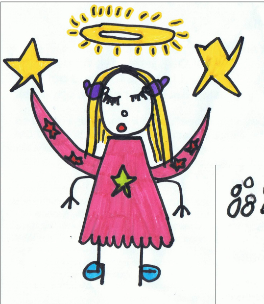
Angel By Layla

To have your event included in the Village Diary, please send details to karen.plumridge@btinternet.com