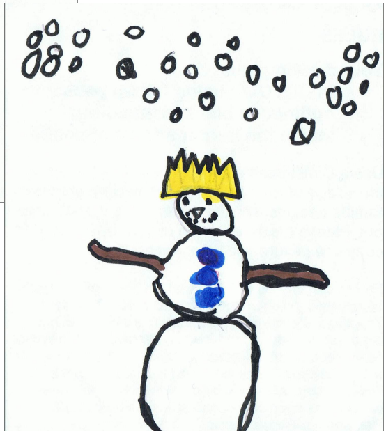
Snowman with Crown By Alex Aldridge