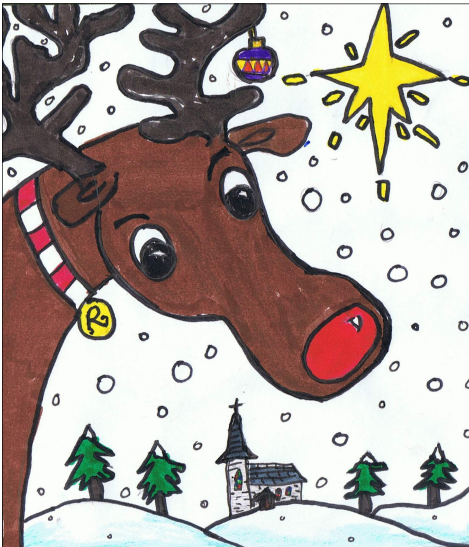
Reindeer