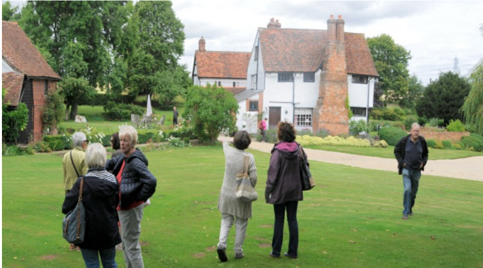
Members of the gardening club at Hoses hall