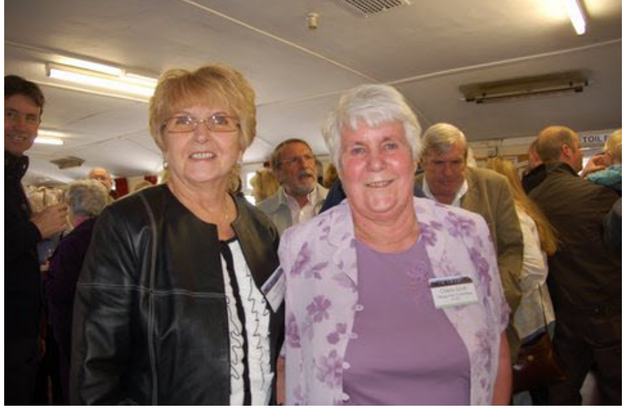
Three Elms Charity Cheque Presentation