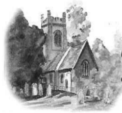
Church of St. Nicholas

Lord Jesus Christ, You have come to us, Born as one of us, Mary's son Led out to die on Calvary, Risen from death to set us free, Living Lord Jesus help us see You are Lord.