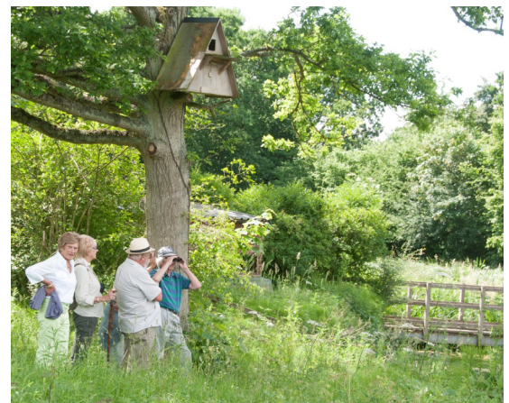
Keeping a look out for birds. (Right)