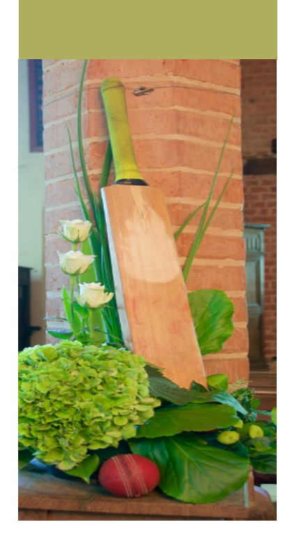
No. 184 November 2016