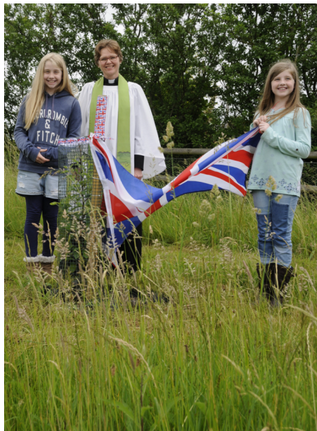
Photos of the blessing of the Queen's tree in the Orchard on Sunday 12 th June