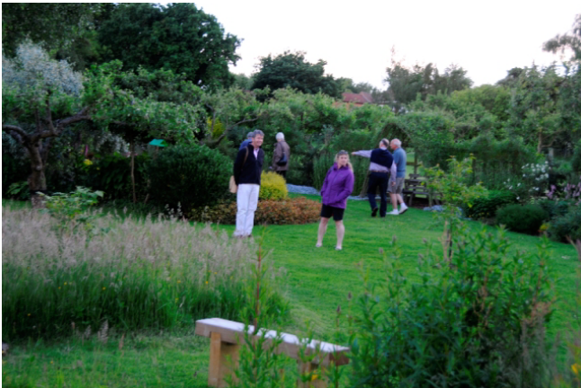
June Visit- Elwy Lodge - Cold but at least its not raining!