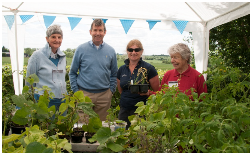
The Gardening Club Plant Stand at the Village fete