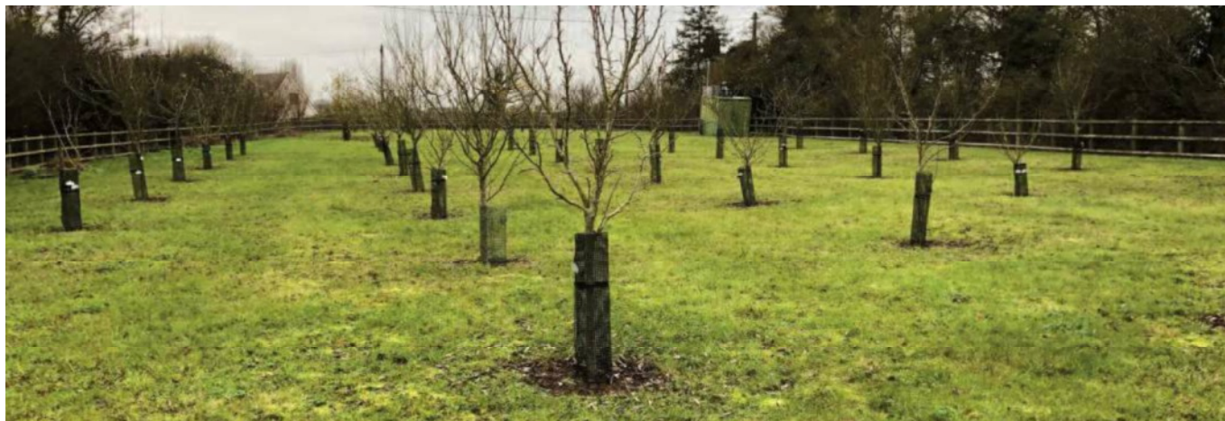
The orchard with the grass cut and all shipshape for the winter.

Its been a quiet time in the orchard this year with all our planned social events cancelled due to the Covid outbreak. Our plans and work produced had been in an advanced state for the VE day anniversary, Harvest Festival and Orchard Fruit Celebration events, hopefully we will be able to repurpose the preparations for social events next year.