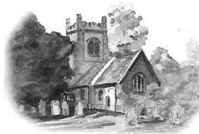
Church of St. Nicholas