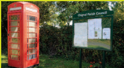
Village Green, Chignal St James

The Parish Council has provided three Notice Boards where you can see a map showing local footpaths and bridleways, details of up-coming events and activities such as Coffee Mornings and Quizzes, public information notices and Parish Council Agendas. The Notice Boards are located at The Village Green, outside the Village Hall in Chignal St James and by St Nicholas Church in Chignal Smealey.