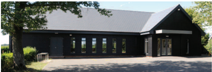
Front elevation of the new village hall