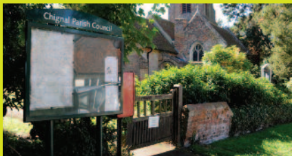
St Nicholas Church, Chignal Smealey