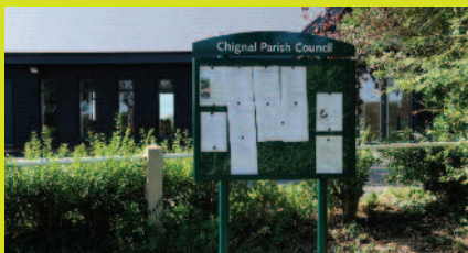
Village Hall, Chignal St James