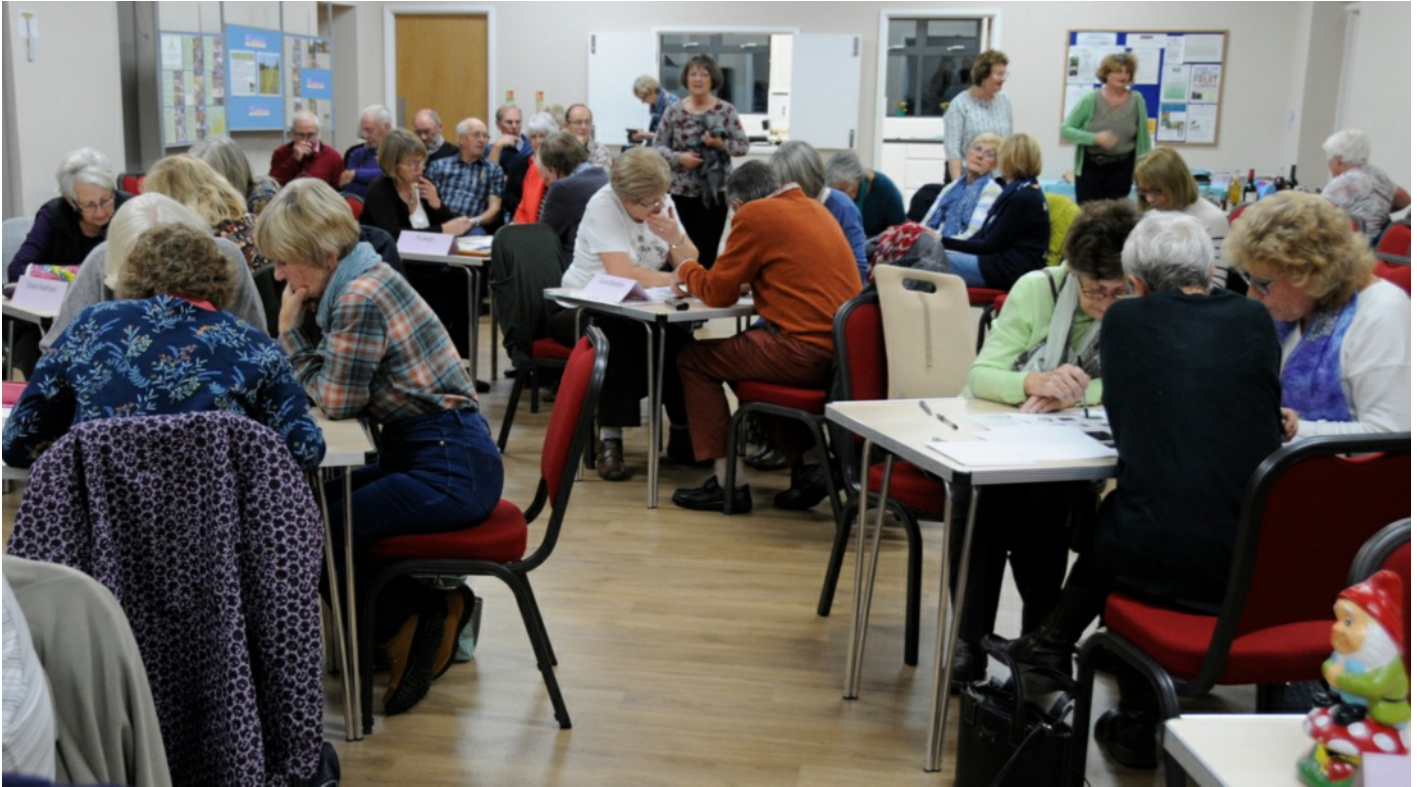
Seven teams entered the inter club gardening quiz hosted by Chignal & Mashbury gardening club in the village hall.