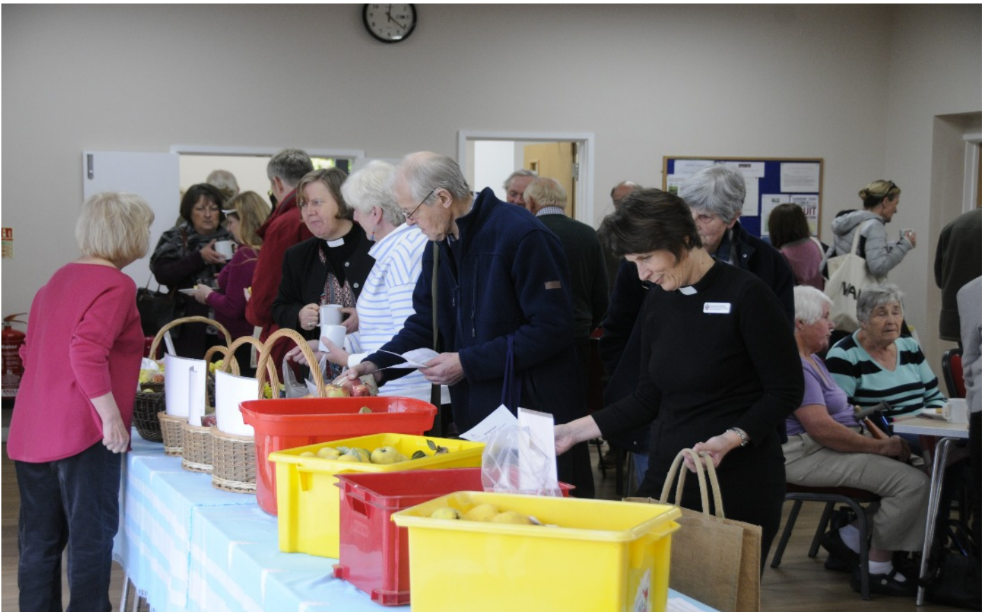
“ Fruit Celebration ” on 20 th October in the warmth of the Village Hall. “