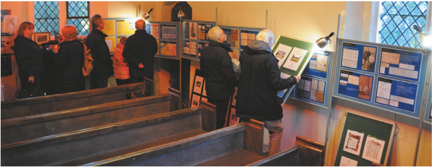
Part of the launch of the exhibition at St Nicholas church.