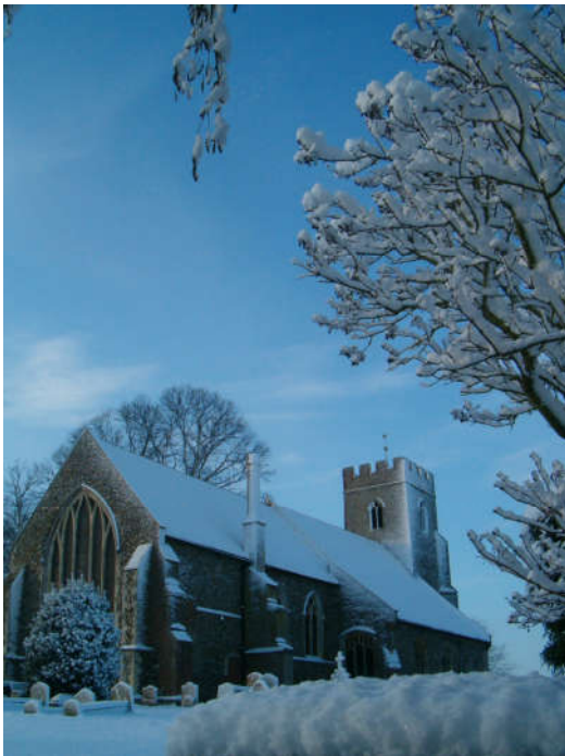
Left - Snow on St. Andrew's 18 th December 2009