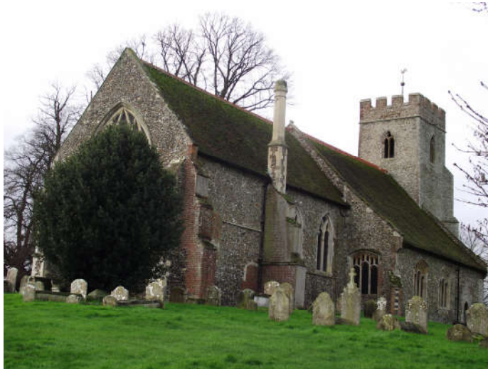
St. Andrew's 19 th December 2015